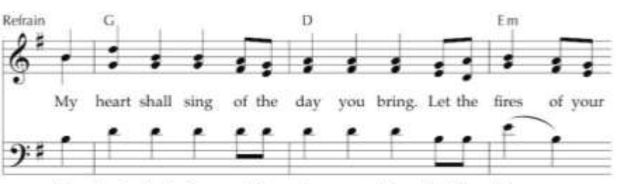
My heart shall sing of the day you bring. Let the fires